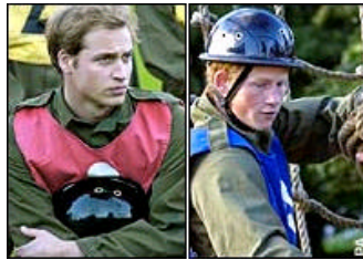
William scored seven out of ten; Harry got four in the same test

We have seen people with very good degrees get very poor scores and those who have just scraped a few A-levels get very high scores. A score of 10 out of 10 means you are a genius, while one or zero means you are barely functioning. Seven, which William received, is very, very good. He also displayed good leadership skills. On the showing he gave at the RCB there is no reason why he shouldn't make a very good officer...."